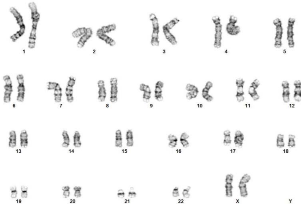
Figure 5. G-banding karyogram